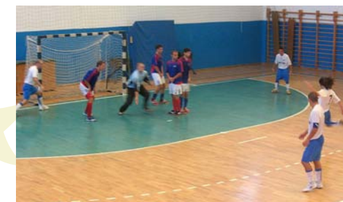
Roma IUMS fire a free kick

The Slovenian home team was playing against the Italian team for the position of 13-16 place. The Italian team started the game with their goal but the Slovenian team soon caught them. The result was tide to the 27th minute when we saw the last goal on the game, from the Slovenian team, which led them to their victory 4:3.