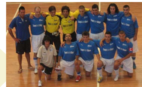
Roma IUMS team photo